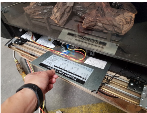
Pull metal decal out