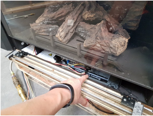
Open bottom louver

The serial number of the unit can be found on the metal decal attached to the unit. To access the metal decal, first turn off the power to your unit, open the bottom louver on the fireplace (see photos below).